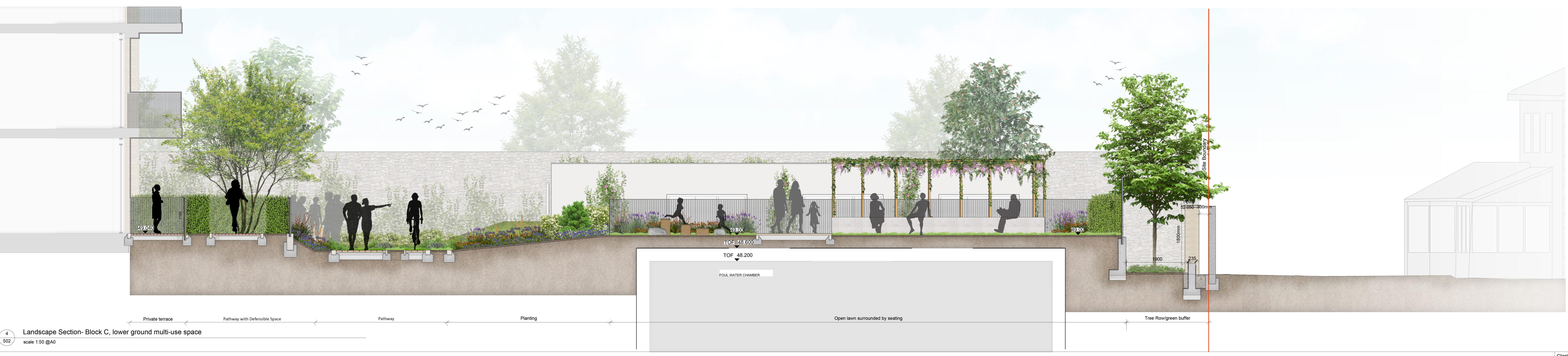
4 Landscape Section- Block C, lower ground multi-use space scale 1:50 @A0

Cameo & Partners Cargo Works - ET 5.07 1-2 Hatfield, Watsons, London SE1 8PQ Company Registered No: 8756613 T: 0203 1760 130 E: info@cameoandpartners.com