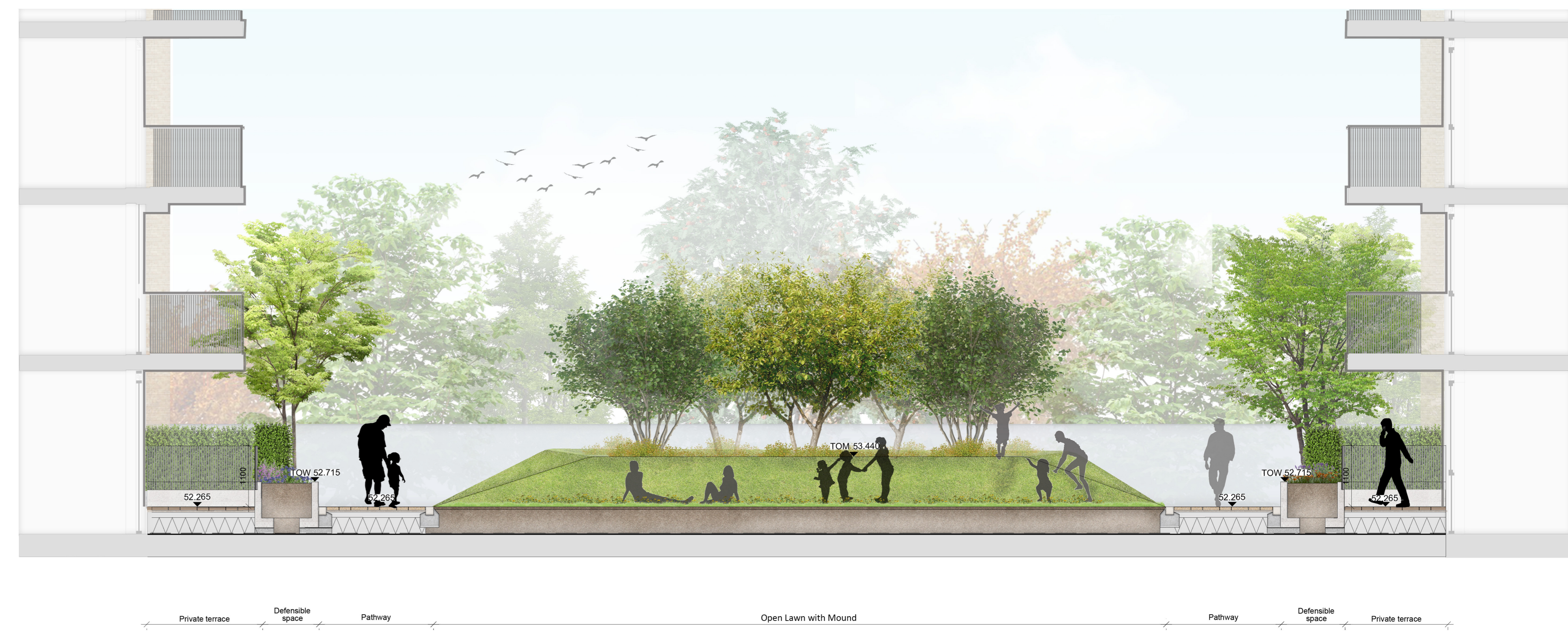
3 Landscape Courtyard Section- Block B and Block C scale 1:50 @A0