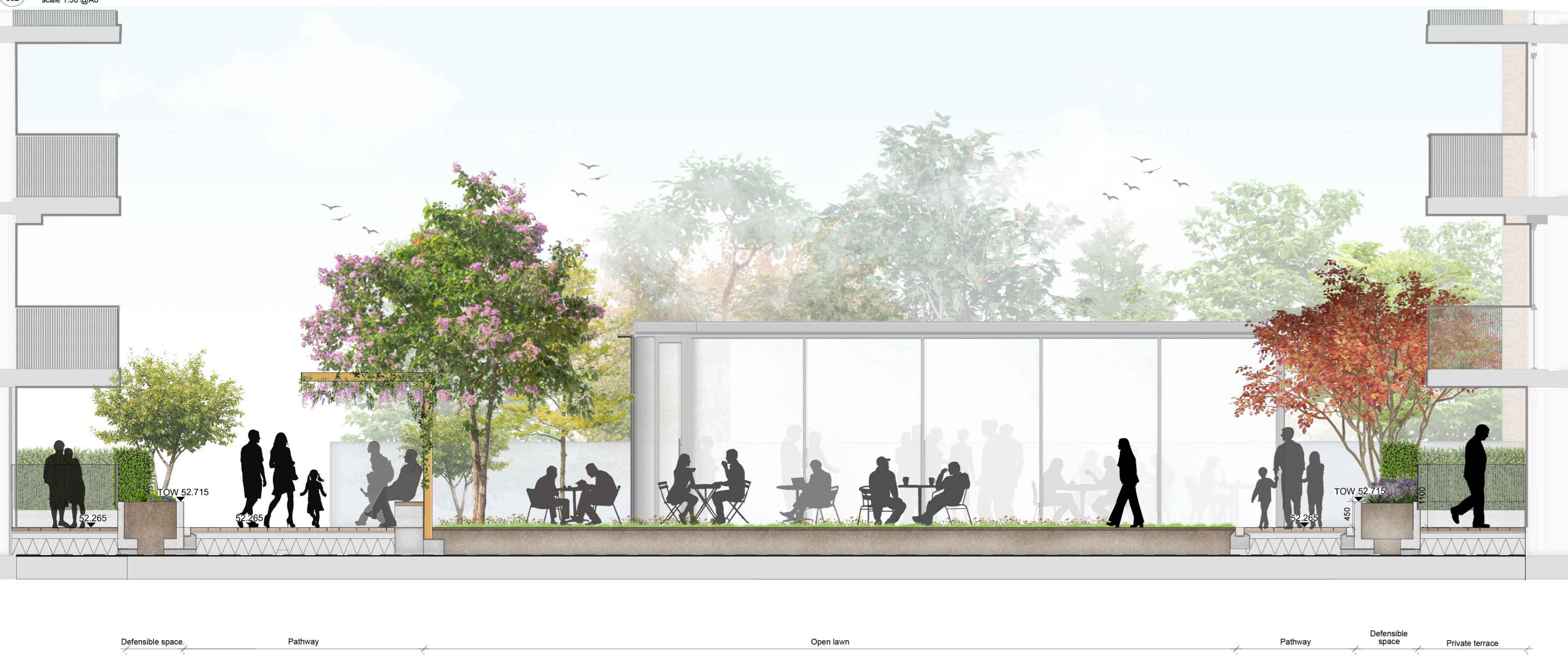
2 Landscape Courtyard Section- Block A and Block B scale 1:50 @A0