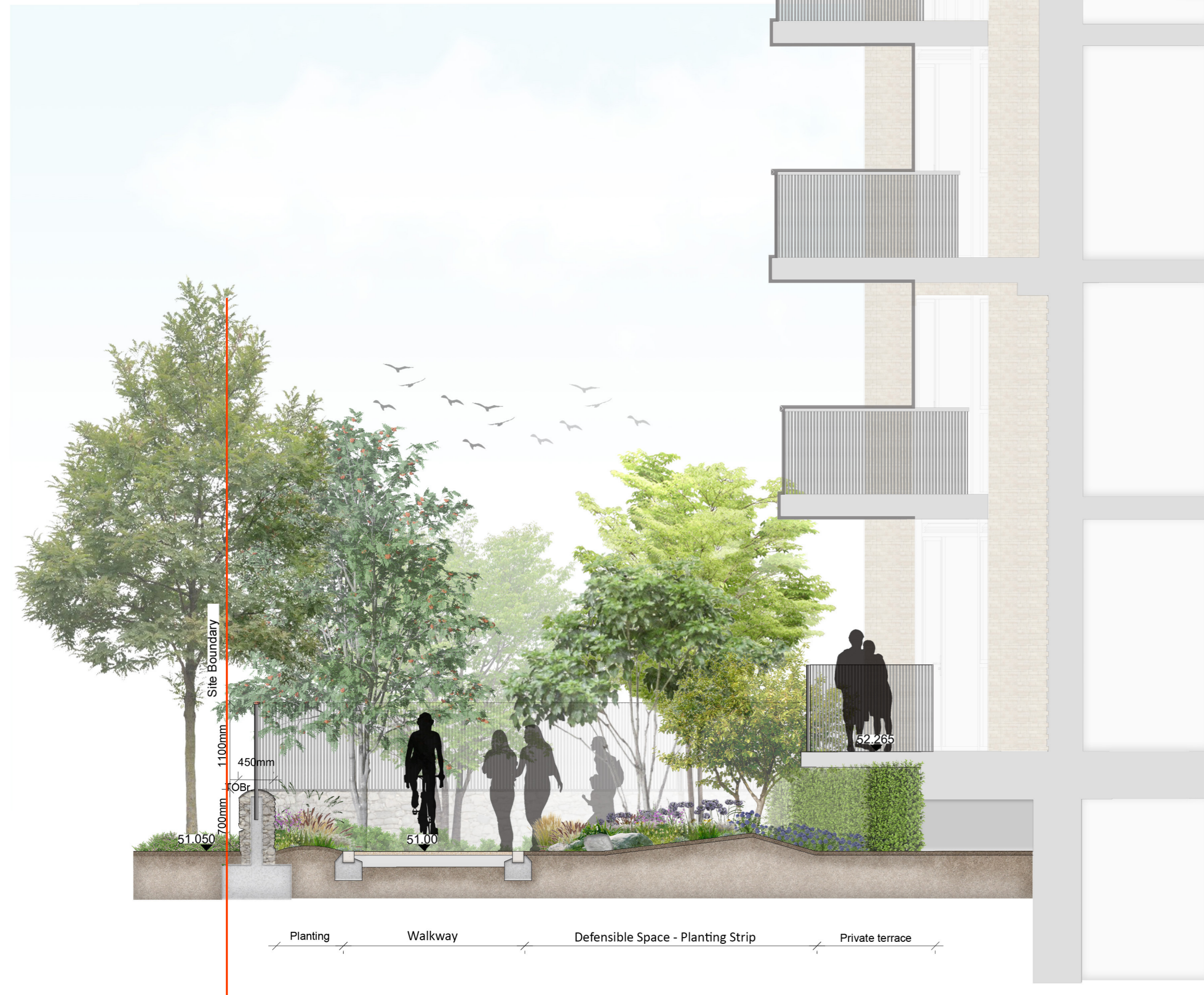
1 Landscape section- Block A, Semi public walkway, connection from N11 toward the plaza scale 1:50 @A0